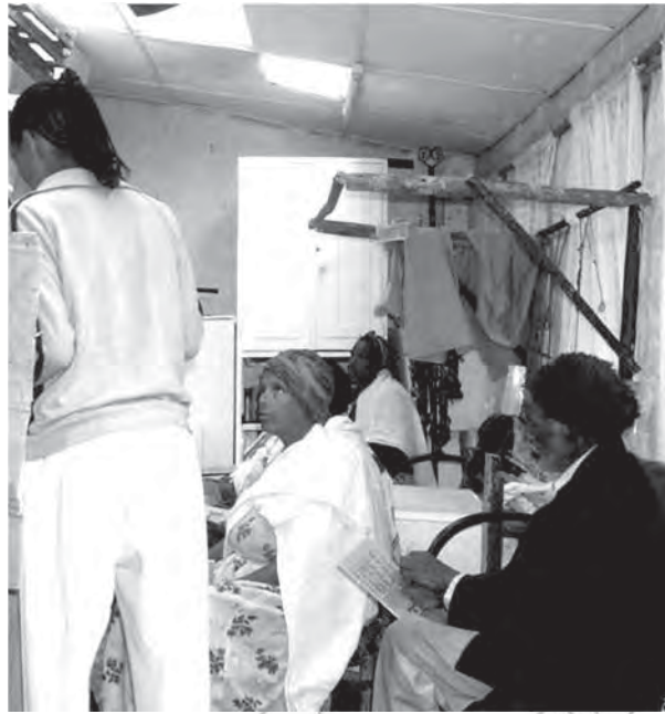
Students teaching older adults literacy skills