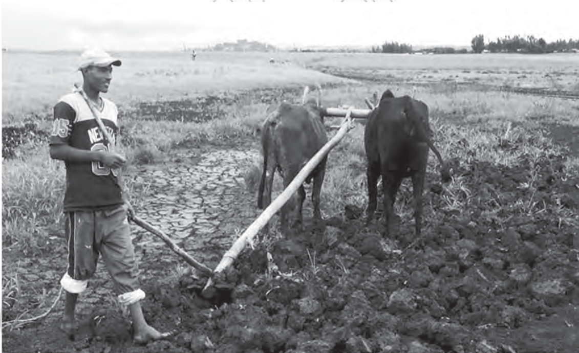
Physical labour is no less important