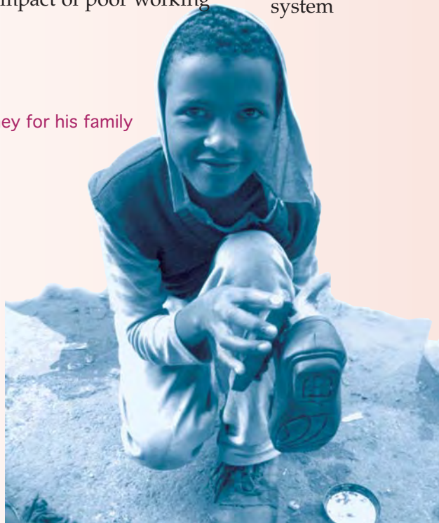
Shoeshine boy earning money for his family