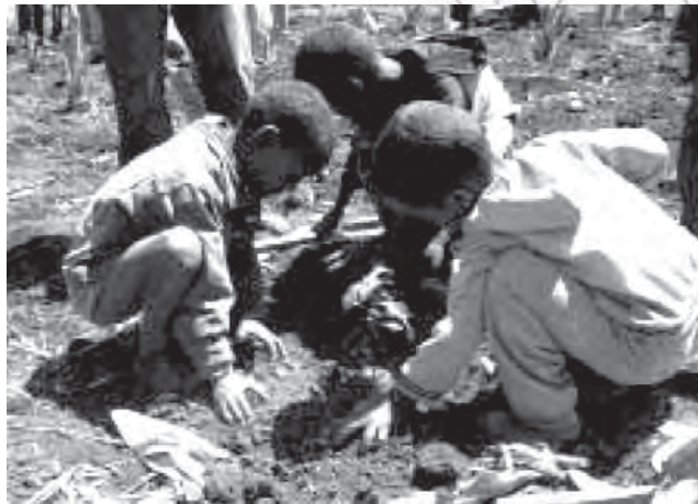
Children develop good working habits at an early age

When you lack good working habits you will not accomplish your assigned tasks well. If the work is not accomplished, people who need those goods or services will not benefit. The organization will not benefit either because it will not achieve its aims and goals. Without good working habits of its citizens, the country will stay in poverty because the economy will not grow. Therefore, lack of good working habits hurts both the individual and the country.