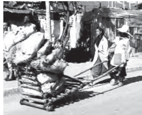
All types of work are important

All types of work are important and should be respected. Both white collar workers and blue collar workers are important because we cannot